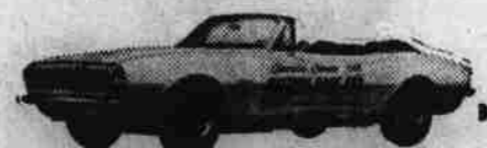
CAMARO CHOSEN 1967 INDIANAPOLIS 500 PACE CAR

Now, during the sale, the special hood stripe and floor-mounted shift for the 3-speed transmission are available at no extra cost! See your Chevrolet dealer now and save!