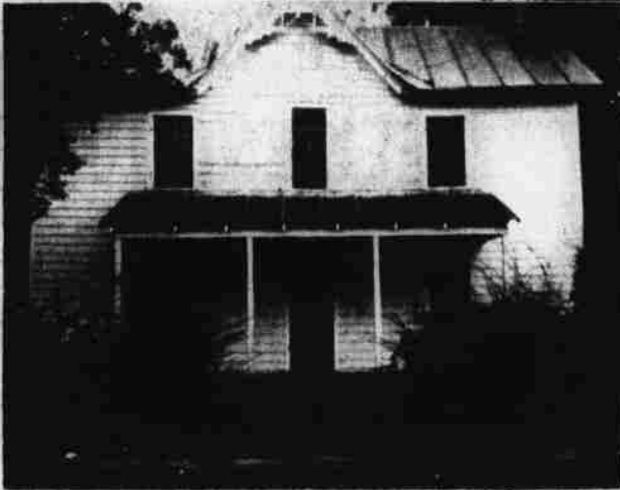
TIMBERS OF OLD BRIDGE IN HOUSE

We bet that you didn't know, that right in Hertford stands a house that was constructed from timbers from the old float bridge shown above.