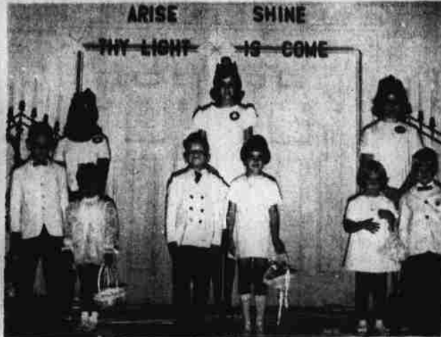
Those crowned as G. A. Queens and receiving scepter were as shown above with their attendants: (Left to Right)