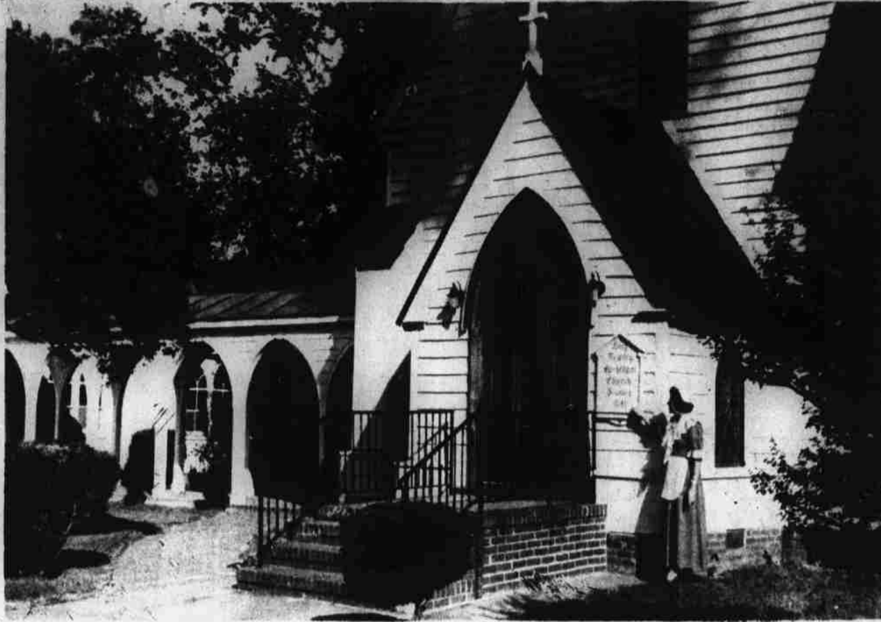
Church of the Holy Trinity (Episcopal) will be open to the public Friday and Saturday as a part of Perquimans' 300th birthday celebration. Located on Church Street, this is the oldest church building in Hertford and

On Saturday, October 24th, the Perquimans County Marching Unit travels to Norfolk, Va., for the annual Oyster Bowl Parade.