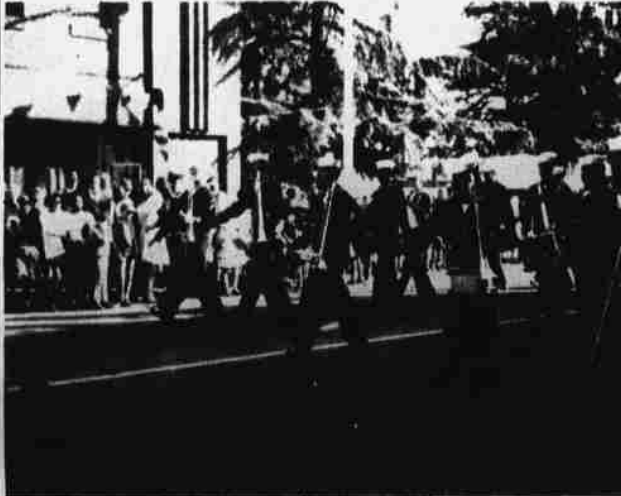
U. S. NAVY BAND PARTICIPATES AT PERQUIMANS BIRTHDAY PARTY