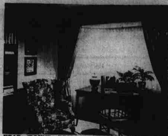
YEAR 'ROUND BRIGHTNESS —Waverly's all-cotton print can't be beat for practicality in slipcovers and draperies. Whether it's a permanent installation or a refreshing change for fall or summer, the Aston Hall print combines beauty with easy care. Both the slipcover and the drapery can be laundered or drycleaned to perfection, insuring a fresh, bright room the year 'round.

GARAGE SALE FEB. 17th 10 A.M. - 6 P.M. 102 CAROLINA ST. Living room suite, recliner, refrigerator, table, chairs & many others.