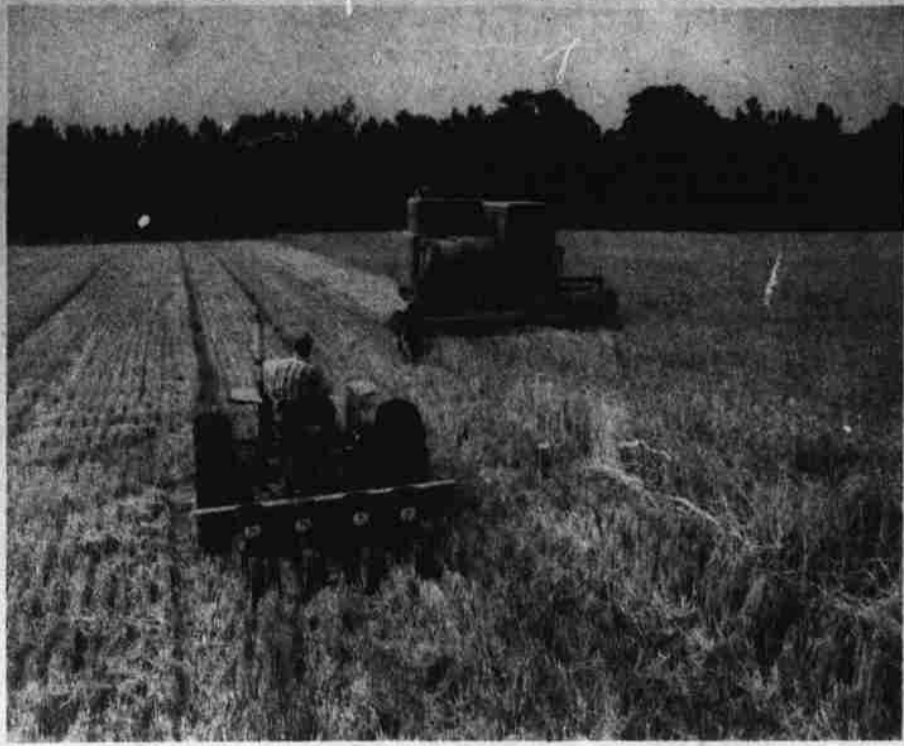
This photo shows soybeans being planted immediately following the harvest of small grain by the minimum tillage method—No land preparation