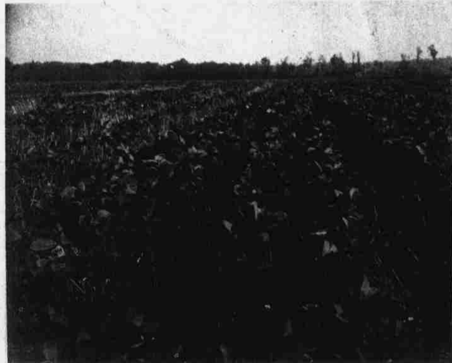
The above photo shows the soybeans as they are getting above the height of straw stubble.

of crops grown by minimum tillage. Other crops grown by this system are being increased including grain sorghum and smallgrains.