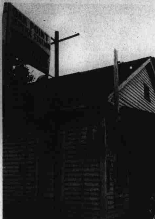
ROBBERY — This service station was robbed of approximately $80 in cash when owner Alton Moore was closing Sunday night. The two black males involved escaped on foot. At press time, no suspects had been arrested.

If you are an alien — submit one of the following: Alien registration card I-151, U.S. Immigration Form I-94, AR3a, I-186, I-185, SW-434, I-95a, or I-184. Contact your nearest Social Security Office to apply for a social security card — either an original number or duplicate number.