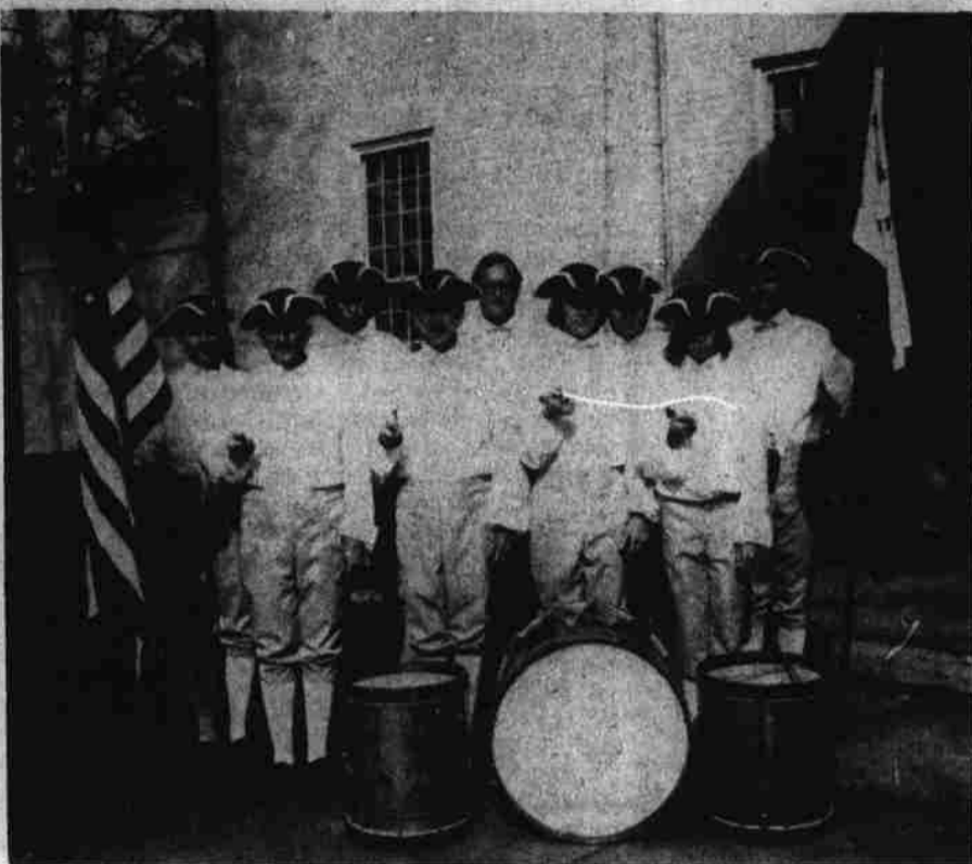
THE HERTFORD FIFES AND DRUMS

Officials pointed out that the Perquimans County Board of Education should be commended for their forward thinking in this matter.