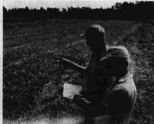
PLANNING — Conservative planning is the key to wise land use.