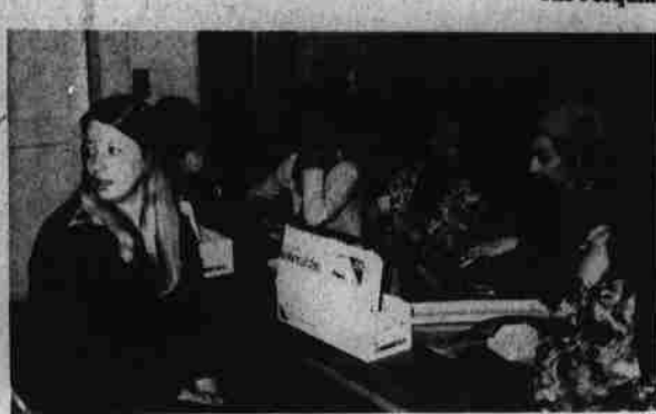
fluid. The visit netted 101 pints and was sponsored by the Perquimans County Jaycees and the local chapters of the Red Cross.