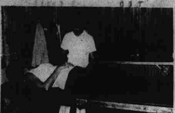
BLOODMOBILE VISITS — The American Red Cross Bloodmobile from Tidewater was at the Hertford First Methodist Church on Monday collecting the life-saving