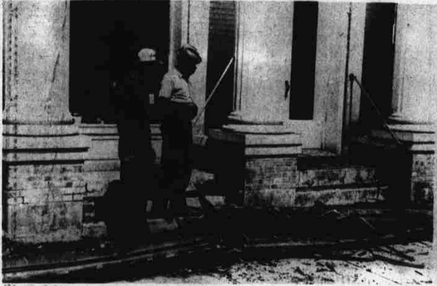
FORESIGHT — Workers with the Town of Hertford were called out Friday to remove overhanging material at the site of the old bank building on Church Street. Officials authorized the work showing foresight since the material could have fallen and injured a passer-by.