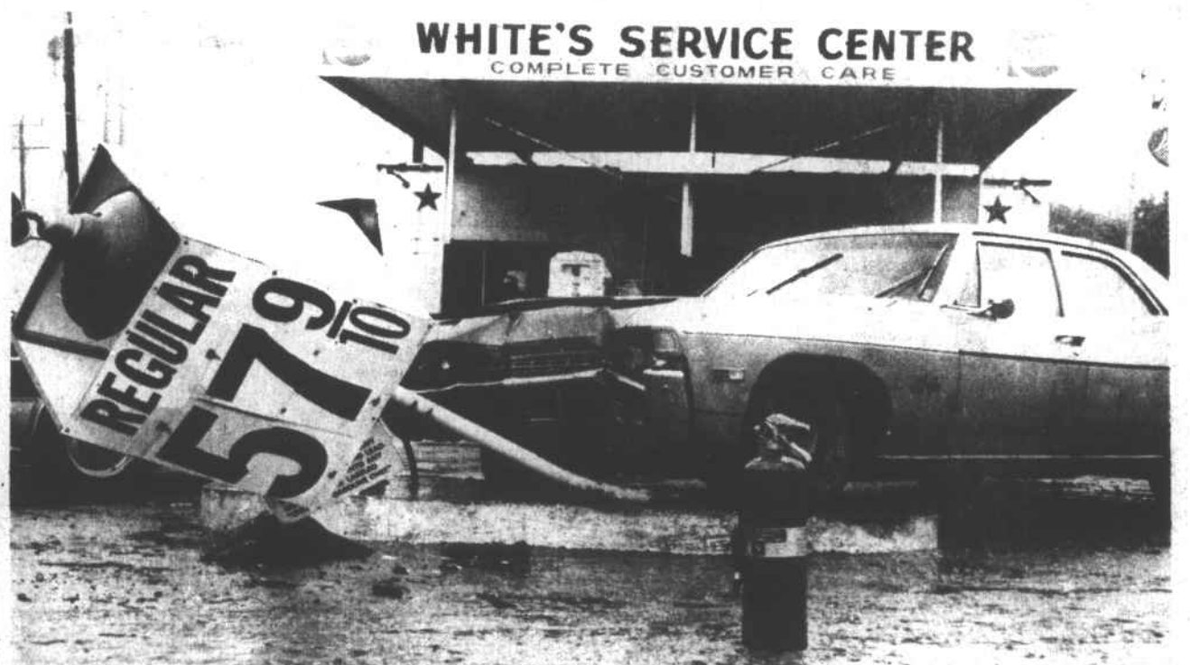
TOO FAST FOR CONDITIONS — Considerable property damage resulted from this mishap in Belvidere Monday around 11:30 a.m. According to investigating trooper