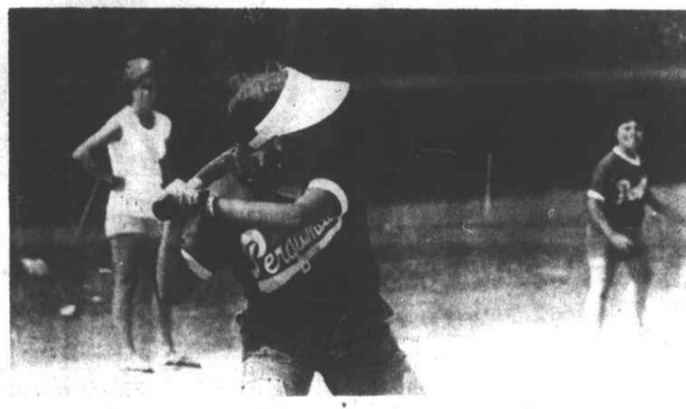
GIRLS' SOFTBALL UNDERWAY — One of the many summer programs being offered by the Perquimans Recreation and Parks Department is a softball league for girls, action which recently got underway locally. Above, two deter-