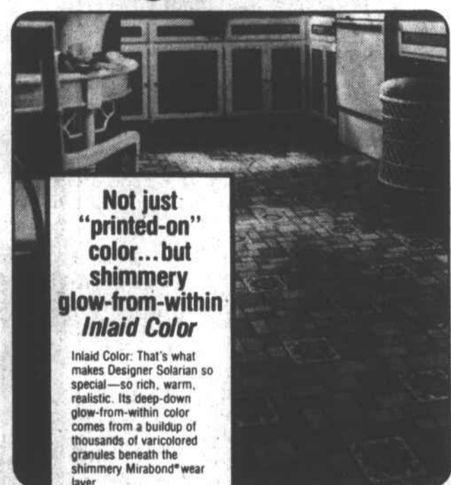
Floor design copyrighted by Armstrong.

Bring your home the easy-care beauty of famous Armstrong Designer Solarian