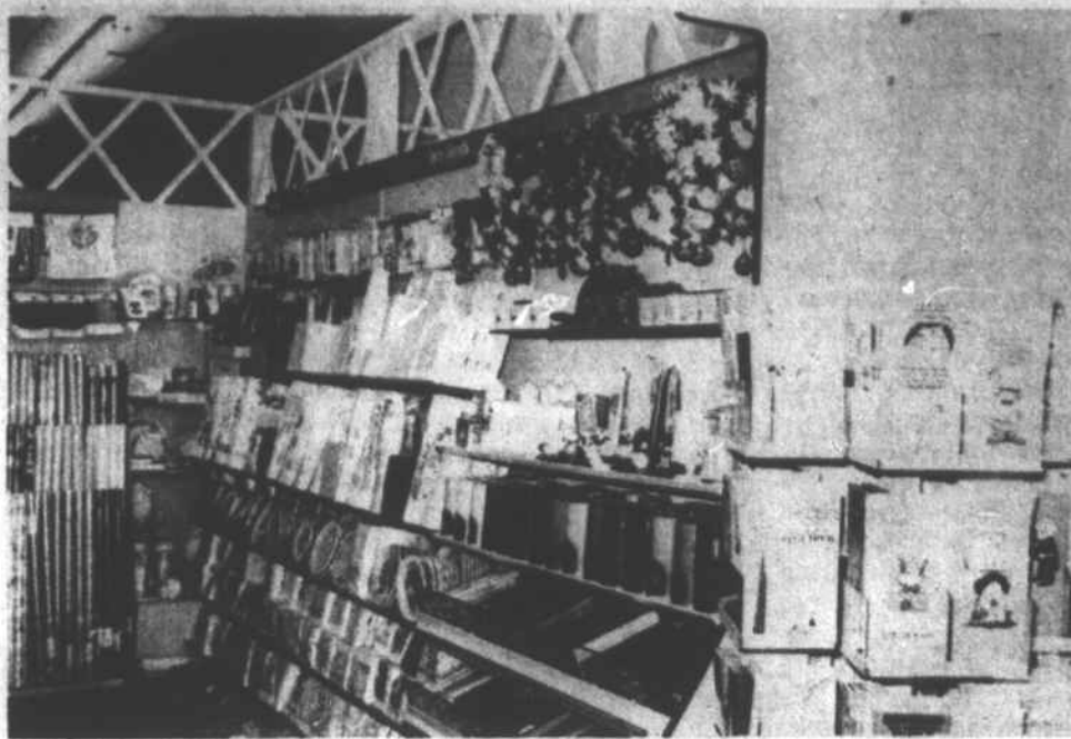
MUCH TO CHOOSE FROM — Pictured above are just a few of the items that can be purchased at Punkins Card and Gift Shop including candles, cards, small gift items, and wrapping paper.

with the remaining 18 percent in the "average" category. In fact, Parrotte related that 18 percent of the Academy students achieved perfect scores on the tests. The results of the Gates-MacGinitie Reading Tests show that the average student in every grade level is scoring a minimum of eight months above the national level in reading comprehension. "In fact," said the Headmaster, "the fifth-grade scores led the entire Academy with that class average standing at 21 months above the national level in that category." According to the Headmaster, the Academy tests yearly in order to evaluate the educational progress of its students. The battery of tests administered yearly includes the Gates-MacGinitie Reading Test; the Criterion Reference Test; the Stanford Achievement Test and the Otis Lennon Mental Ability Test.