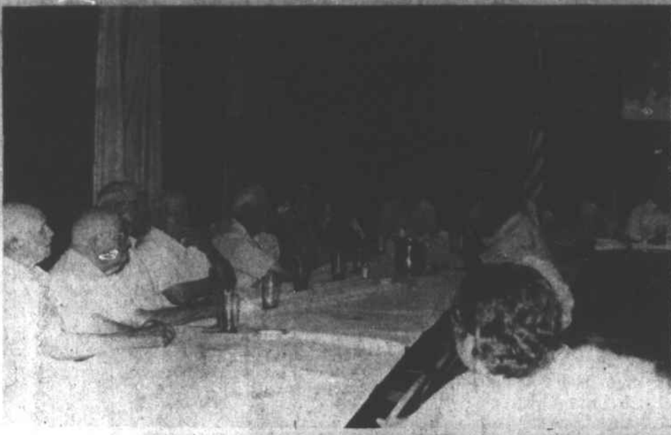
RURITANS HOST SPECIAL GUESTS — Area senior citizens were the guests of honor when the Durants Neck Ruritan Club honored them at their regular meeting held last week. The seniors enjoyed a dinner meeting with the civic workers.