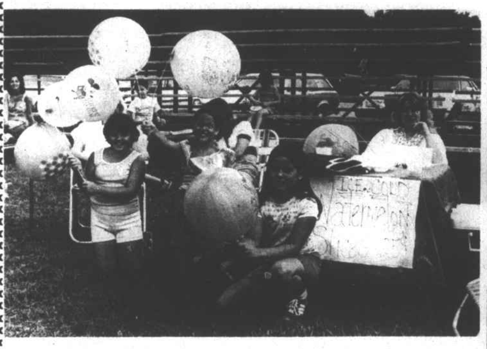
FESTIVE AIR - The early evening in- school ballpark. Above, some of the cluded some activities sponsored by the younger set exemplify the festive, Perquimans County Jaycees in the high holiday air.