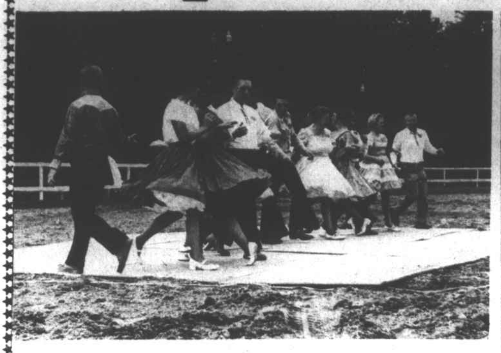
VISITING DANCERS - Spectators at the Colonial Squares of Edenton did the annual horse show were given a some fancy footwork. special intermission treat July 4th when