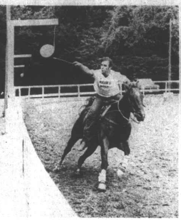
ANNUAL HORSE SHOW - Some county residents spent part of the day at the annual holiday horse show sponsored by the Perquimans County Horse and Pony Club. Shown above is a participant in the open balloon race, one of 27 exciting events offered to the crowd.