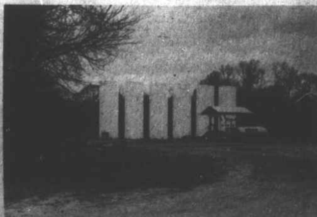
Tanks in new Locations