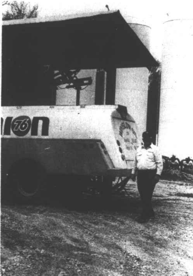
Work at Winslow Oil