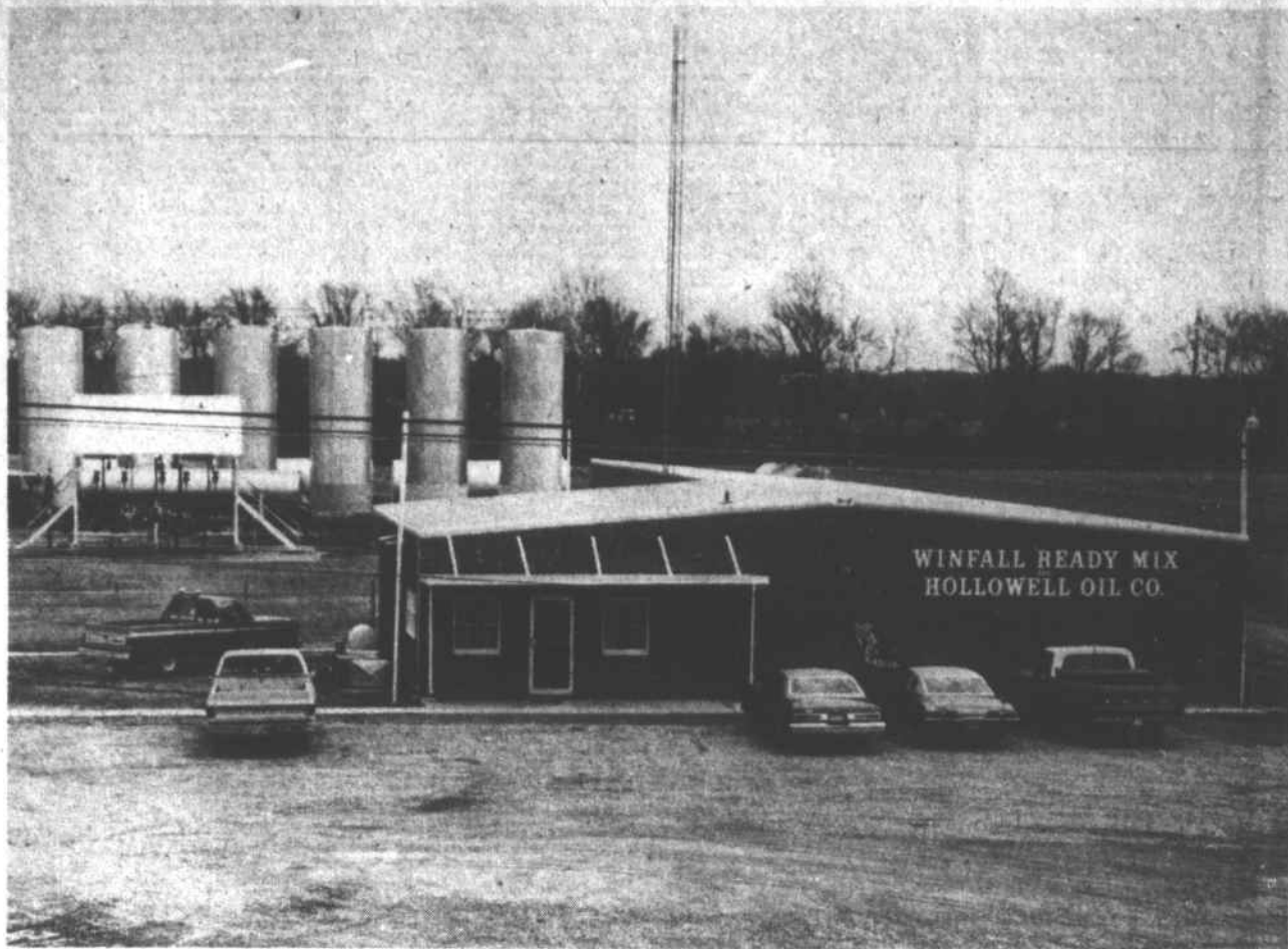
Hollowell Oil Company