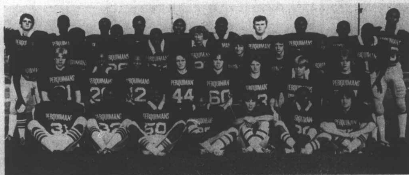
PERQUIMANS PIRATES, 1980