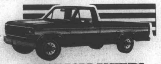
TOUGH FORD PICKUPS