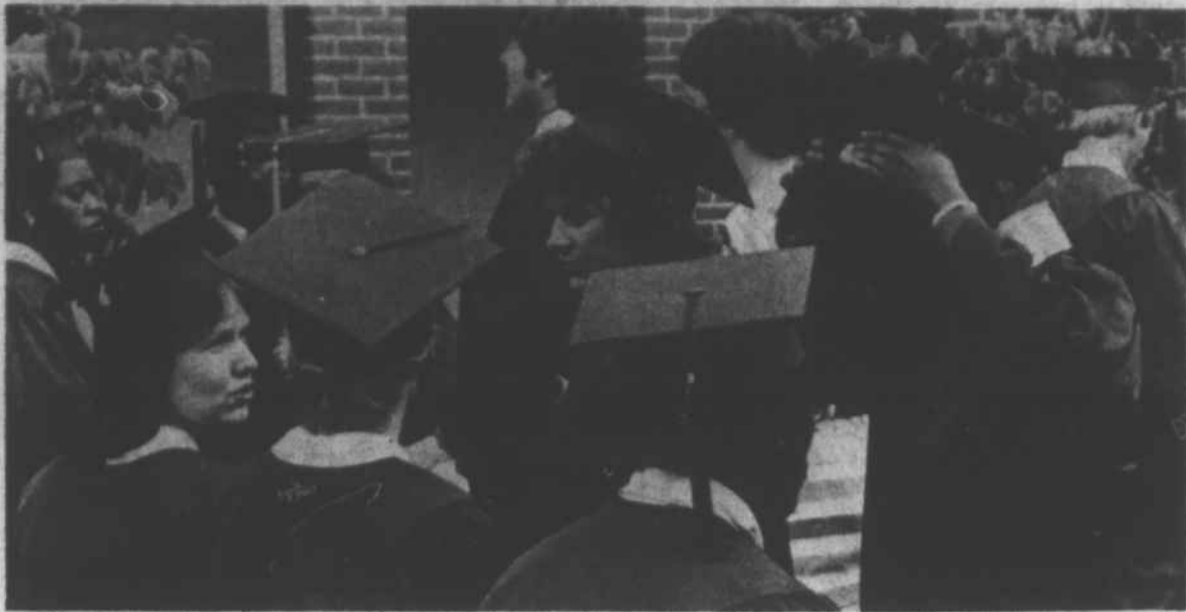
WAITING—Candidates relax and make final adjustments to caps and gowns before the Day graduation at College of the Albemarle.