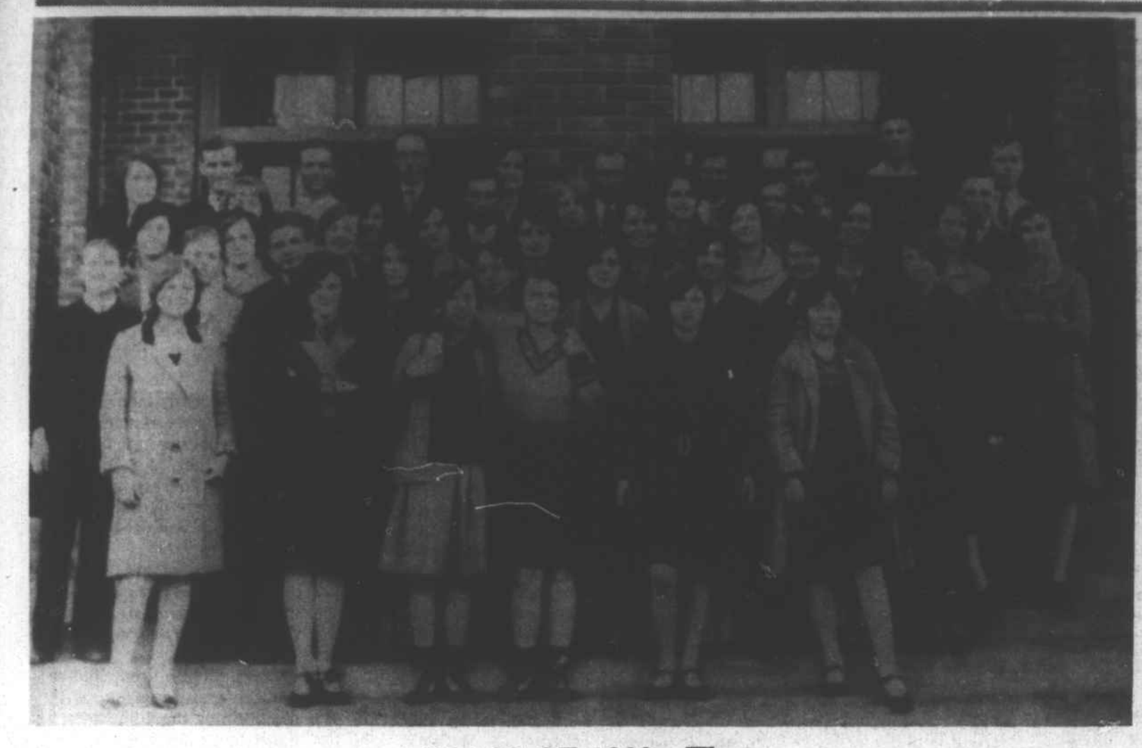
CLASS OF 1929 - Then