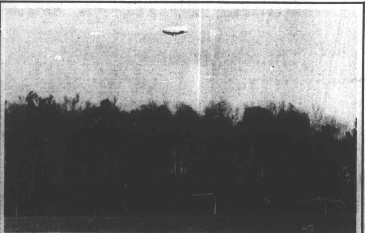
It's a bird, it's a plane, it's a blimp???