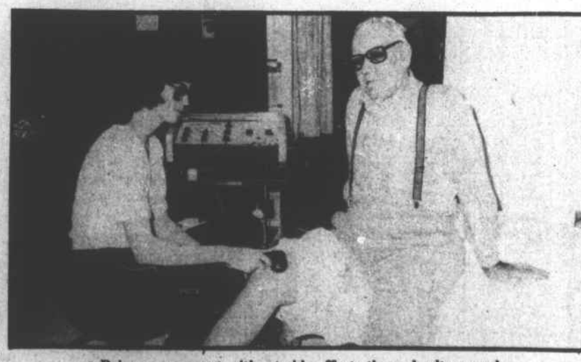
· Pain management without side effects through ultrasound, TENS, and other treatments.