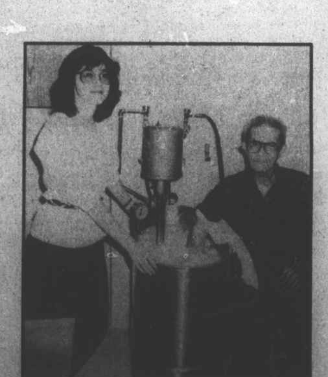
· Private whirlpool sessions for treatment of arthritis or soft