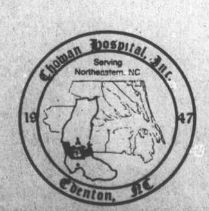
Virginia Road . Edenton, N.C. 482-8451