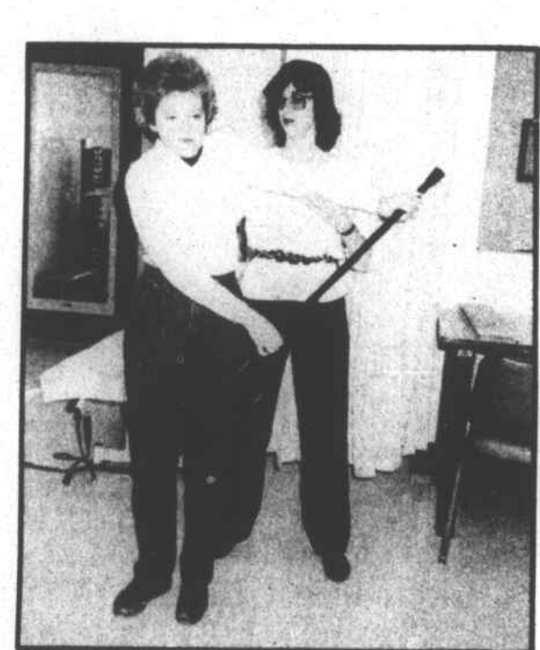
Exercise programs designed for your individual needs follow ing illness or injury.