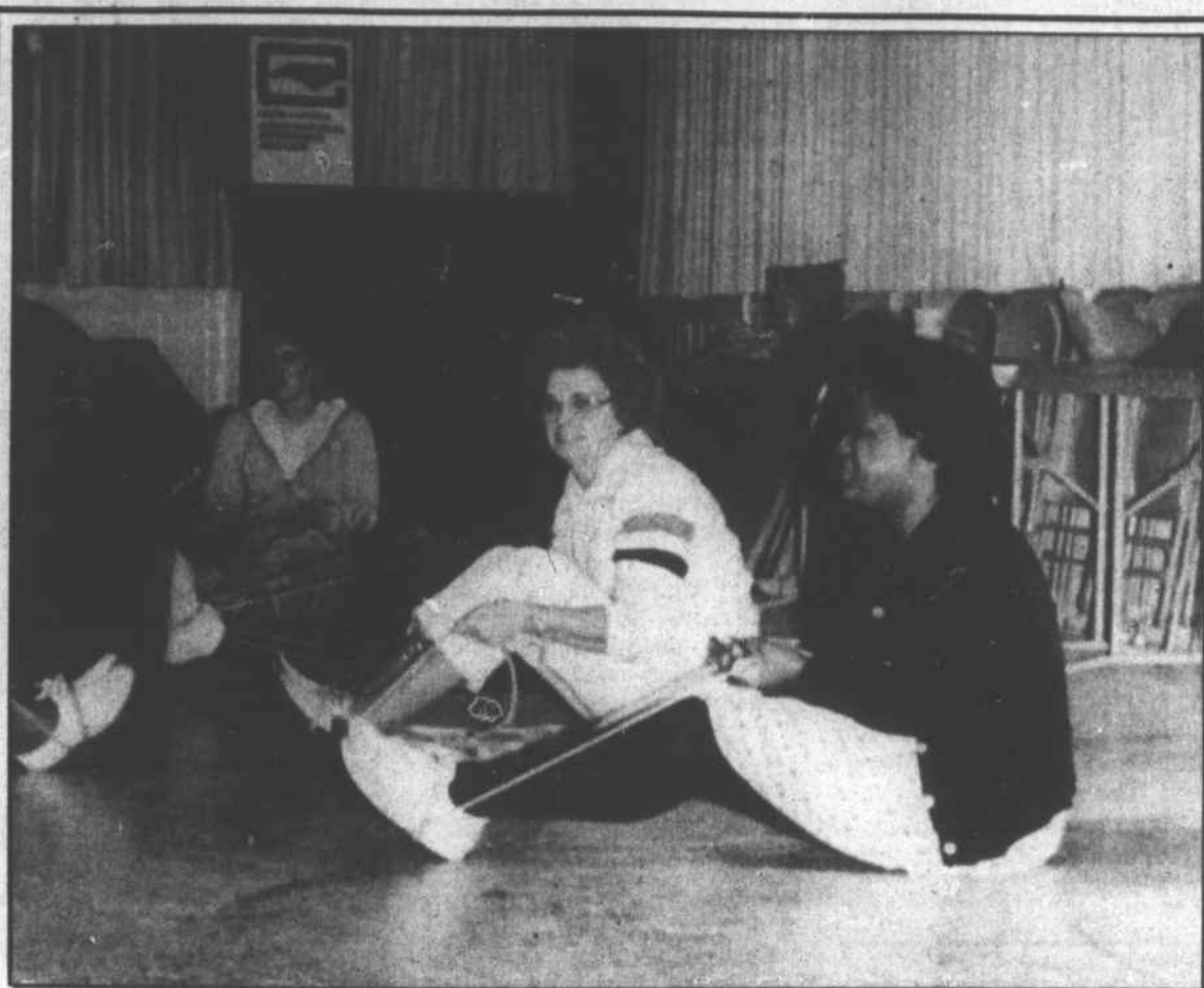
And A One, And A Two...