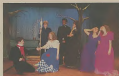
PCHS drama students will perform musical 'Into the Woods' —Page 10