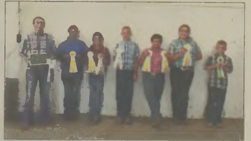
Livestock team competes in Raleigh, 3