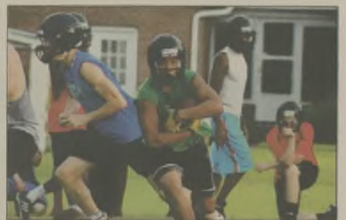
Williams expected to play big role this football season, 6