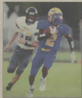
Edenton overpowers Perquimans 55-12, 8