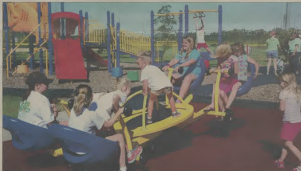
Seven girls play on a four-seat teeter-totter last week during the ribbon cutting for a new $350,000 playground at the Perquimans County Recreation Center.