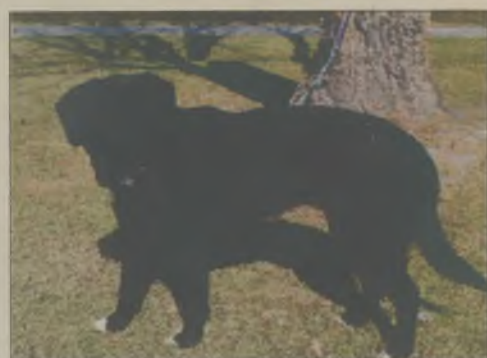
See this week's Pets of the Week, 4