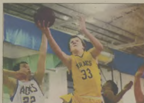
Pirate boys fall to Camden, Edenton, 8