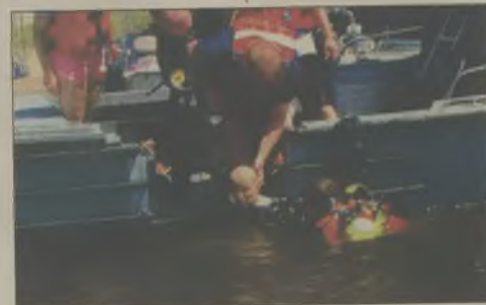
Dive team holds exercise, 4