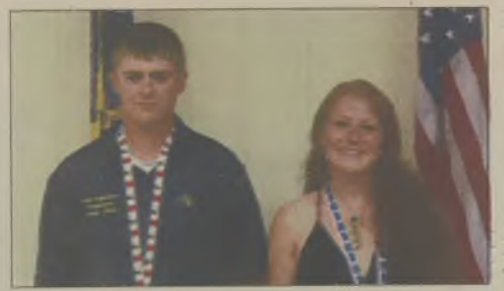
Club awards scholarships, 4