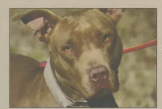
Pets of the Week, 7