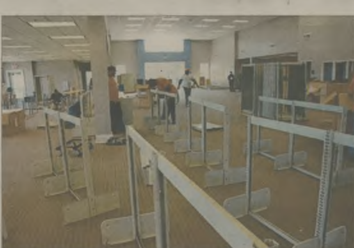
Dozens of workers were busy assembling the book shelves in the new Perquimans County Library last week.

actual transportation of the County Commission. books to the new location on