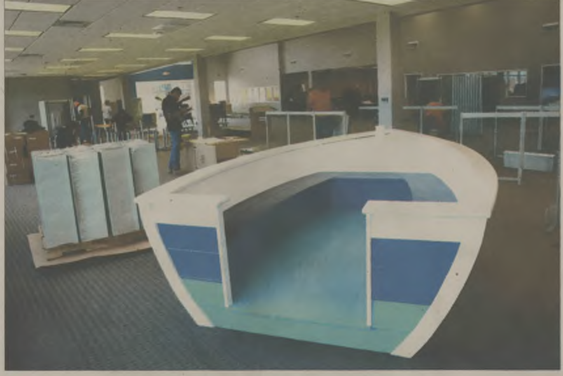
A rather unique feature of the new Perquimans County Library will be a boat. It's designed for the children's area and is a place where kids can climb in, sit down and enjoy a reading a book.