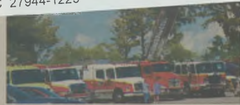
National Night Out Photos, 3

P9/C9*****CAR-RT LOT**R 008 A0004 PERQUIMANS COUNTY LIBRARY 514 S CHURCH ST HERTFORD NC 27944-1225