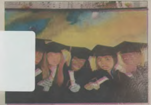
Mural honors Class of 2020, B1

PERQUIMANS COUNTY LIBRARY 514 S CHURCH ST HERTFORD NC 27944-1225