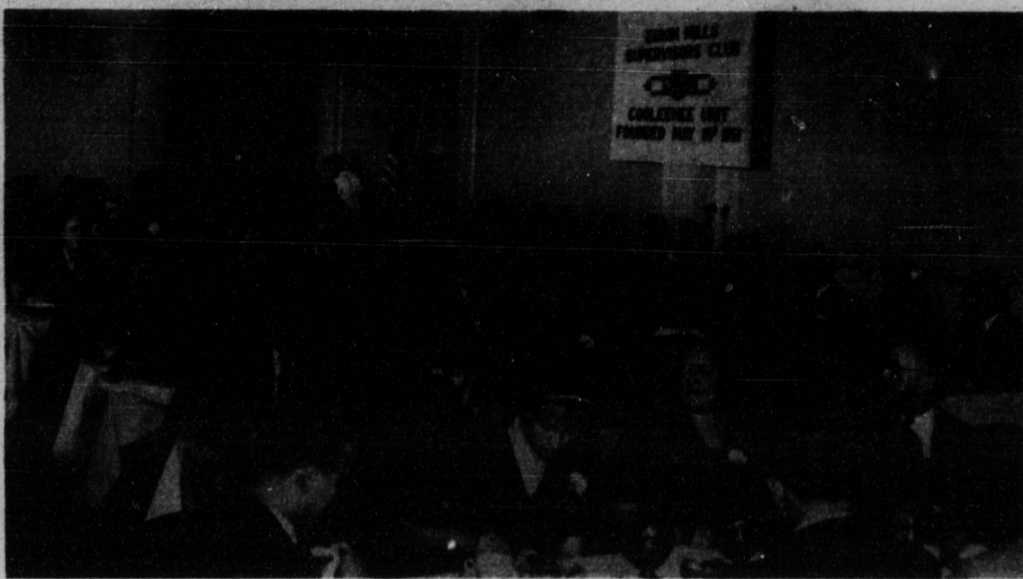
General view of the banquet which was held at the Yadkin Hotel in Salisbury, Saturday, March 1st.