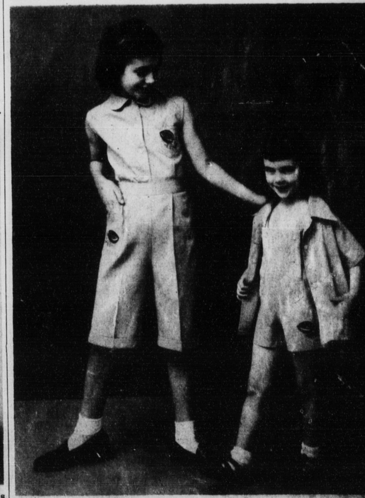
These two little girls are all dressed up in Erwin "BluSurf Sportdenim" designed by Millbrook.