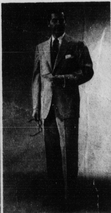
McGregor & Company makes this man's suit of Erwin "Salute Sportdenim."