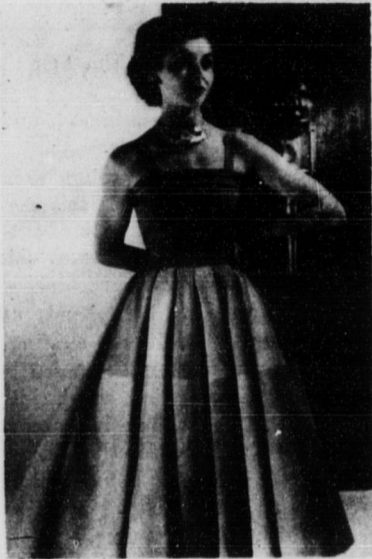
Korday Sportswear, Inc. uses Airborne Denim with Superset Finish to fashion a dress which typifies "sophisticated denim."

One imaginative advertisement in a recent issue of Glamour reads "It's DeNiMiTe! To mix, to match, to love! The most 'Be-hue-tiful' separates in town and/or country! ART-MOR'S exclusive denim by Erwin Mills." You would really have to see them to believe it, but here's a list of the Erwin denim fashions which this company advertises: cap, covered-back halter, pedal