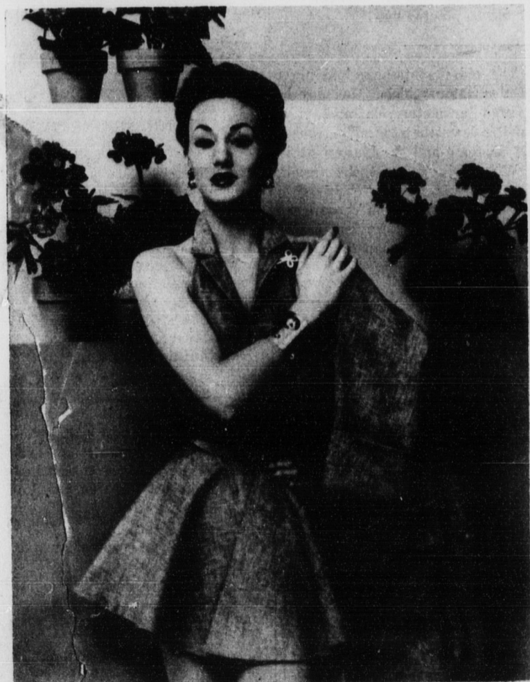
For sewing at home, choose "Salute Sportdenim" for handsome, durable town or country wear. This is a McCall's pattern, Number 8870.