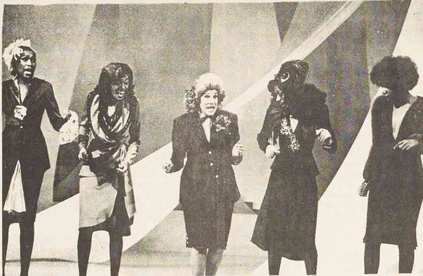
PATTI ANDREWS (center) of the Andrews Sisters joins the Pointer Sisters in singing her trio's 1973 hit, "Bei Mir Bist Du Schon," on the one-hour musical and comedy special, "One More Time," to be broadcast THURSDAY, JAN. 10 (9:00-10:00 PM, ET) on the CBS Television Network.