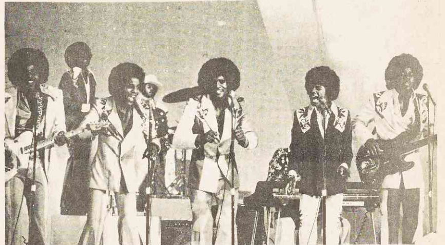
THE JACKSON 5 sing "Get It Together" and do a medley of their hits, on "One More Time," a one-hour musical and comedy special to be broadcast THURSDAY, JAN. 10.

caused by inflammation Doctors have found a medication that in many cases gives prompt, temporary relief from pain and burning itch in hemorrhoidal tissues. Then it actually helps shrink swelling of these tissues caused by inflammation. The answer is Preparation H. No prescription is needed for Preparation H. Ointment or suppositories.