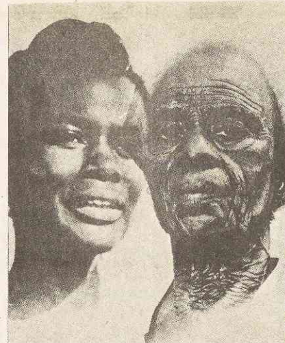
CICELY TYSON'S two faces, one young and one old, will be seen in the Jan. 31, Xerox special "The Autobiography of Miss Jane Pittman." Based on a book by Ernest J. Gaines, the story will trace the life, joys and sorrows of a former slave who lives to participate in the civil rights movement. At 110 years of age, the fictional life of Miss Jane Pittman spans a century of change for black people. The two-hour drama will be shown on CBS television.