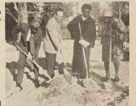
Ground Breaking Services: Tent services with eyes toward a new building.