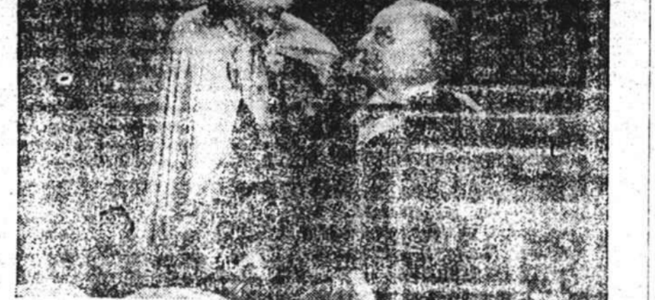
Leslie showed her secret elation when she arrived home.

Slade sniffed and turned a slight. "Do you know who was just here?" Logan gasped. Slade smiled sweetly. "Yes, Lord Mere. I've heard he's one of the best shots in the Grenadiers."