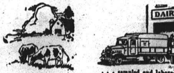
Clean, rich milk from healthy, tested cows

This mark is your assurance of complete protection for purity and quality... on the farm, in the dairy plant, in the bottle.