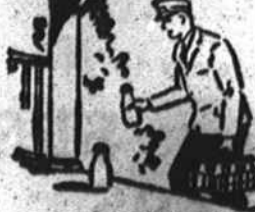
... safeguarded during handling and delivery by the Dacro Bottle and Cap

The Dacro Bottle and Cap are approved by American Association of Medical Milk Commission, Inc. Certified Milk Producers' Association of America, Inc.