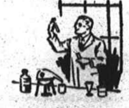
... tested again by our laboratory to make sure the quality is just right