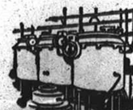
... pasteurized with the latest and most modern equipment