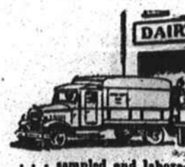
... sampled and laboratory tested when received at our plant