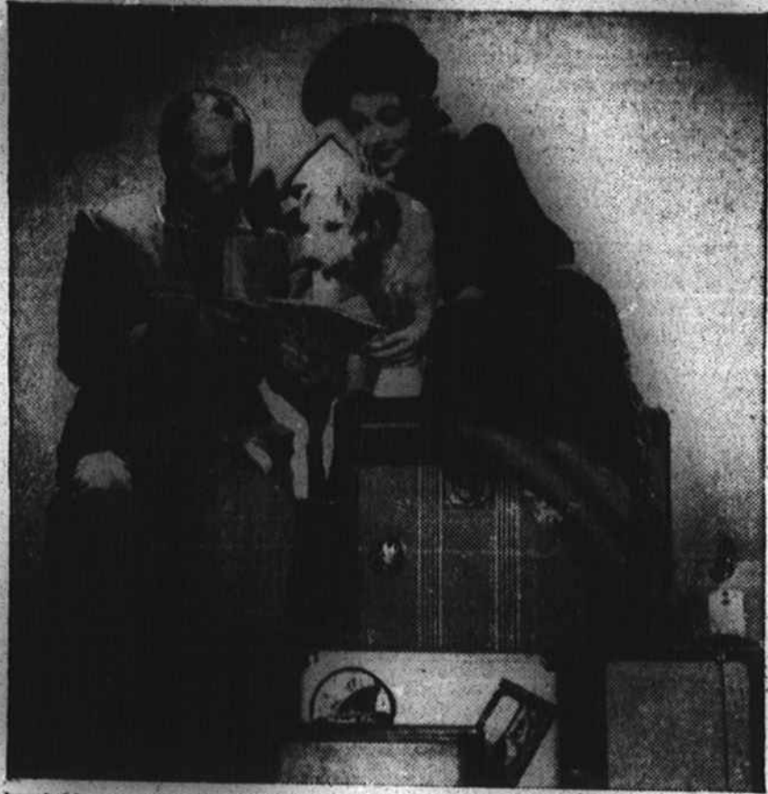
Roland Young, Mr. Atlas and Constance Bennett prior to their trip to the Riviera in Hal Roach's "Topper Takes a Trip," the new comedy at the Imperial Theatre next Monday and Tuesday.