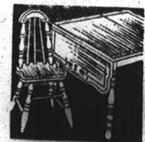
6-PC. UNFINISHED BREAKFAST SUITE