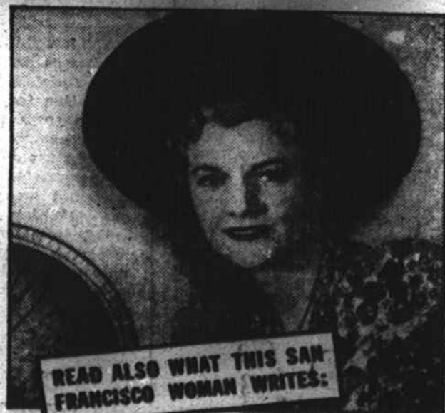
READ ALSO WHAT THIS SAN FRANCISCO WOMAN WRITES:

Last, but not least, take a look at the price tag! You'll find this bigger, finer Dodge costs even less than last year's Dodge!