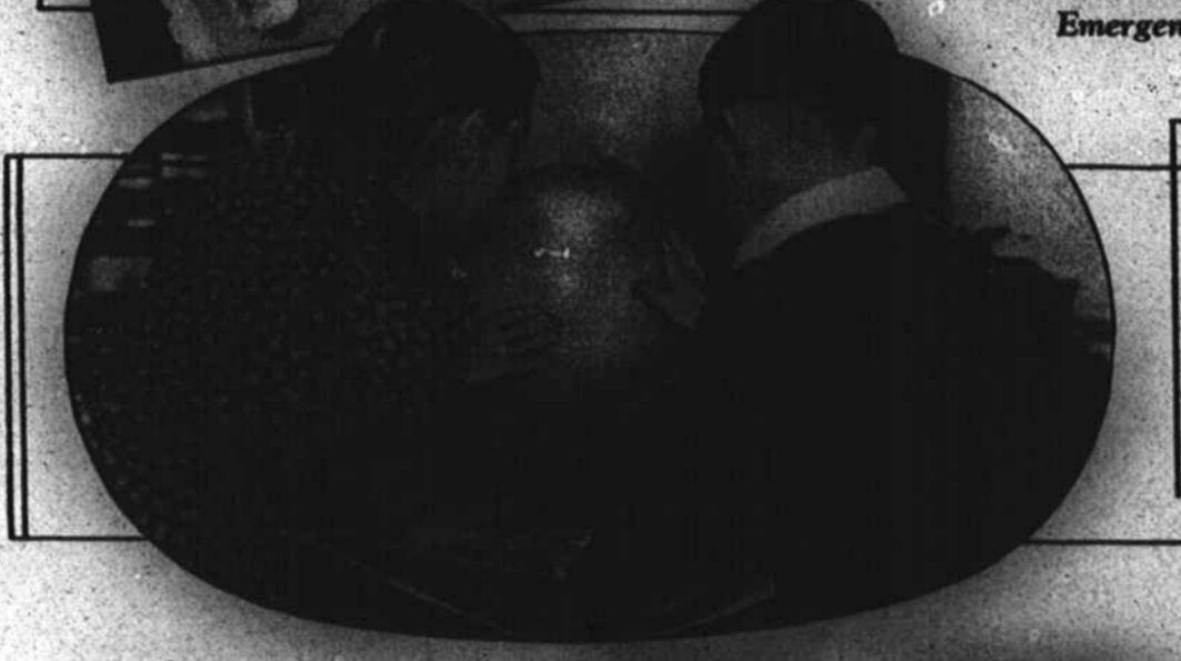
Junior Red Cross members maintain friendly interest in children of other nations