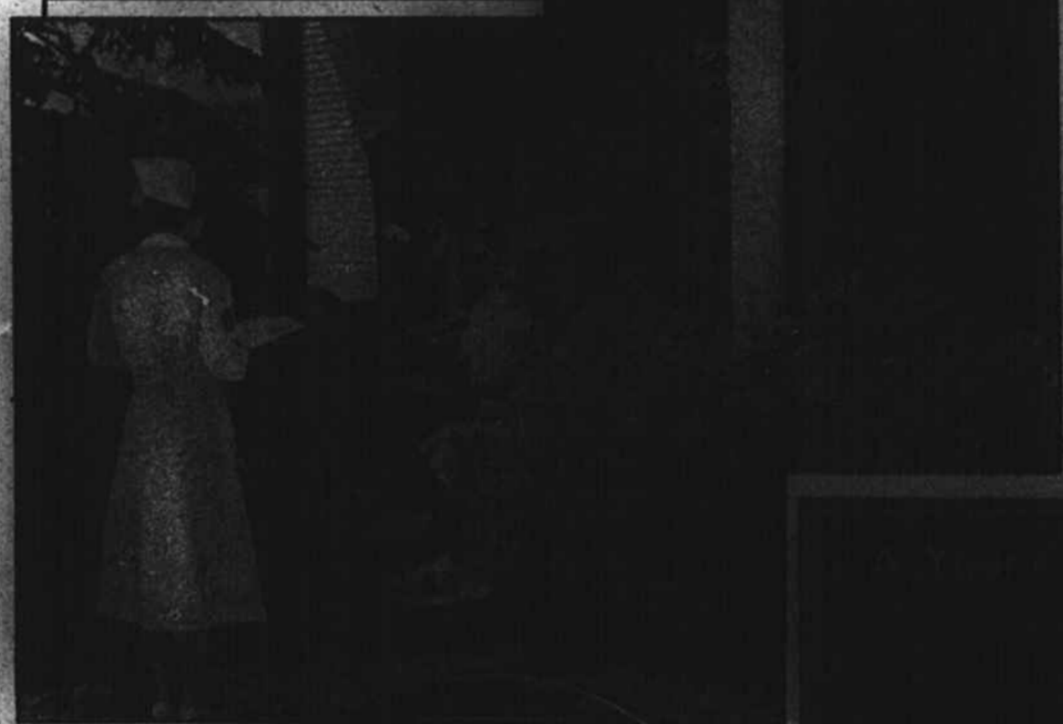
Families prepared against sickness through home nursing instruction by Red Cross nurses