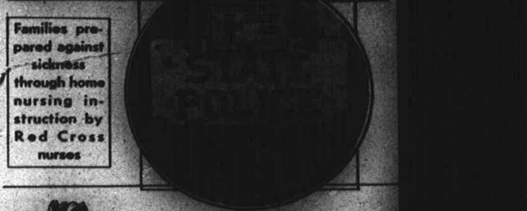
Sign of help on the highway—two million are trained to give first aid to the injured