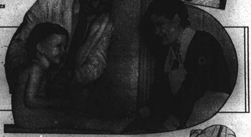
A right start in life—thousands of pre-school children examined by Red Cross nurses under doctors' supervision