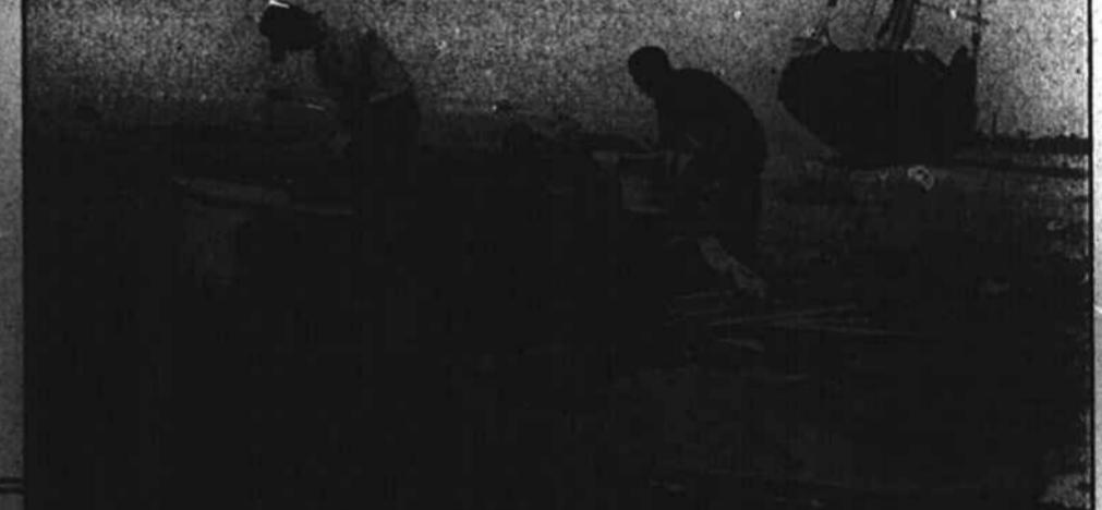
Where Red Cross is the only help—homes swept away by disaster are replaced for the needy by Red Cross. Scene of New England hurricane of 1938