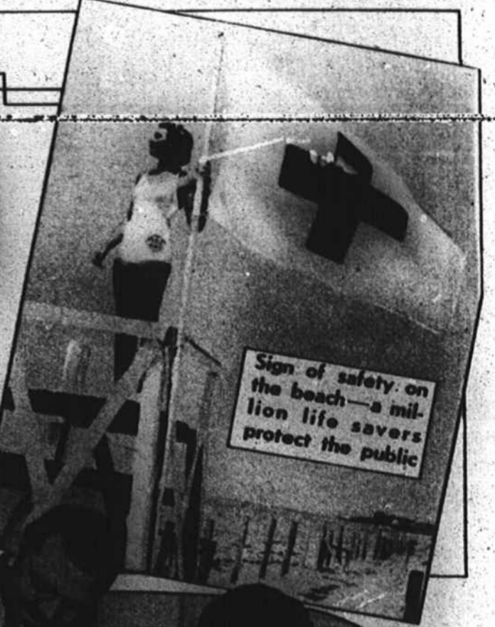
Sign of safety on the beach—a million life savers protect the public

Chartered by Congress as the Volunteer Relief Agency of the United States to Save Lives, Give Relief in Disaster, Fight Epidemics, Aid Veterans and Service Men, and serve the nation in all Emergencies