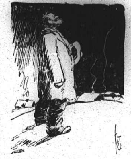
Peter stood alone for a long time watching the star appear.

Peter remembered: How he had come home late that evening; how the earth began quivering like a beast possessed; how he had