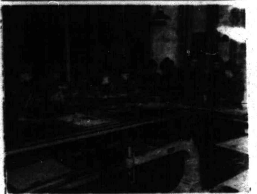
Building and flying model planes is one of the first projects which Air Scouts undertake. Air Scouting, newest program of the Boy Scouts of America, is open to boys 10 years of age and over. In a short course a broad experience is obtained up to the point of actual flight training.

has evaporated. A substantial residue of salt provides evidence; the compound is a brine solution which should be removed from the radiator.