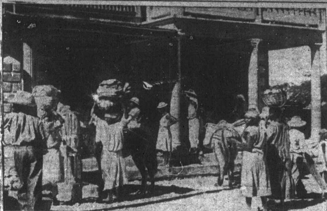
FIRST LARGE-SCALE economic mission to a member country was organized by U.N. and four specialized agencies in 1948 to find solutions to some of Haiti's basic problems. A marketplace in the Caribbean island Republic, which has one of the world's densest populations, is shown here.

simple delight, pleasure, fun, sport, joy of life."