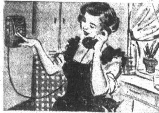
CONVENIENCE IN THE KITCHEN