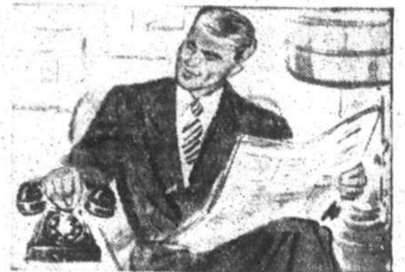
ACCESSIBILITY FOR ALL THE FAMILY